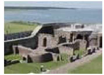
Ft Sumter & Ft Moultrie